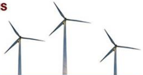
Wind Power Systems