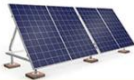
Solar Panel Systems